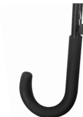
Rubber Coated Crook