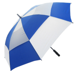
Royal & White