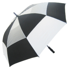
Black & White