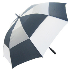
Navy & White